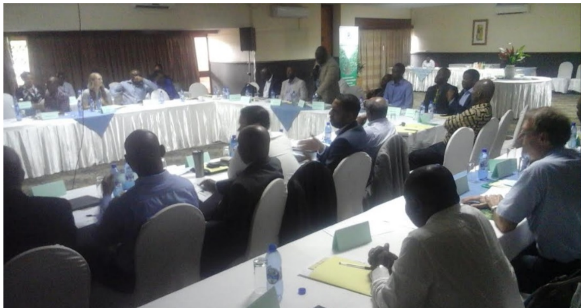
Seed experts discussing challenges affecting the industry

organised the workshop in collaboration with Market Matters Inc. of the United States of America (USA), Lilongwe University of Agriculture and Natural Resources (LUANAR), Alliance for Green Revolution (AGRA) and Seed Trade Association of Malawi (STAM) with funding from USAID.